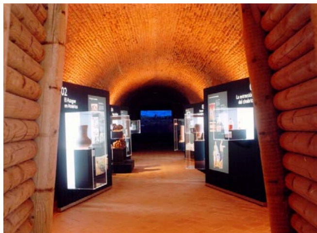
Figure 6. In the museum of mercury

These kilns were used till 1928. In 1954, new ovens of the Pacific, Herreshof type were settled, using propane fuel. They can be visited as well. In the same area has been settled a museum devoted to all the aspects of mercury.