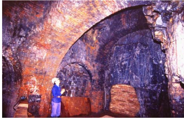
Figure 3. Supporting technique of Diego de Larranaga

The visitors are thus sensitised to the technologies and difficulties of mining, as well as to volcanism, sand sedimentation in the sea 400 millions years ago, and plate tectonics which made the layers of the sea floor vertical. They follow the paths of the convicts (mostly political convicts) who were conducted every morning from their jail to the stopes, through this long blind tunnel so that none could escape, and whose life was very short.