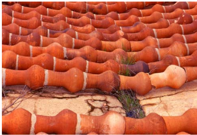
Figures 4 and 5. The ovens of Bustamante

These kilns were used till 1928. In 1954, new ovens of the Pacific, Herreshof type were settled, using propane fuel. They can be visited as well. In the same area has been settled a museum devoted to all the aspects of mercury.