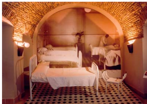
Figure 1. Restoration of the hospital of the miners

The visitors are sensitised to the impacts of mercury on health. It is a building of significant size outside the mining and metallurgical compound. It was founded in 1752 by the superintendent Francisco Javier Villegas, whose name was given to the Foundation. Moreover, it is a magnificent example of synergy, as the funds needed for its construction came from the sale of houses attached to the Almadén's bullring and the benefit of bullfighting shows. It is one of the first hospitals in Spain which had a structure for professional cares and can be considered as an achievement of the ideals of the movement of the eighteenth century medicine. The building was declared a cultural heritage in 1992. The works to restore it represented an investment of approximately 2.5 million euros and were co-financed at 50/50 by the Fundacion Caja Madrid and MAYASA.